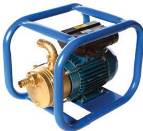
ENM25 in frame